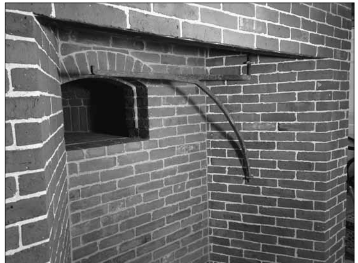
Left: Peter Moore working on the west fireplace. The dome on the left side of the photo is the exterior of the bake oven. Right: The completed east fireplace with the bake oven and crane.