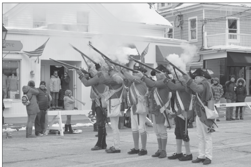
Reenactors from the Third New York Regiment marched with the Historical Society for the St. Patrick's Day parade.

The current Third New York Regiment is a group of reenactors who have chosen the American Revolutionary War as their hobby. Their mission is to faithfully re-create the daily lives of Revolutionary War soldiers, soldier's wives, families, and camp followers using the Canada campaign accounts as a guide. Visitors to the Encampment can expect to see members of the Regiment in authentic dress going about their daily lives as they would have in the campaign period of June 1775 to July 1776, including cooking food over open fires, mending clothing, cleaning their equipment, marching, practicing their marksmanship, and other typical camp activities. This will be a