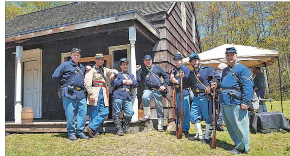
Company K of the 67th New York Volunteers at rest during an encampment.

Please watch our website ( whbhistorical.org ) for more information about this event. We hope that you can join us for this hands-on opportunity to immerse yourself in New York State Civil War history!