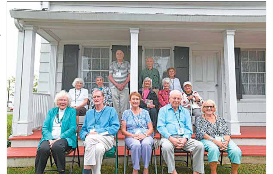
1938 Hurricane survivors met on the 80th anniversary to share their stories.