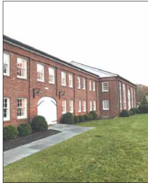
View of the now-restored Mill. The historic 1859 building is at left and the 1960 building (attached) is at right.

The restoration process, although lengthy, has been meticulous, including retaining as much of the original Mill building materials as possible, using salvaged materials where the originals could not be re-used, and incorporating new period-appropriate restoration materials. The exterior walls, roof framing, and remaining mill works were retained, with a new interior structure built to support the walls and hide insulation and utilities. The result is a beautiful restored sawmill building that will remind us of our community's history for years to come. The Society deeply appreciated the "saving" of our historic Mill and was very pleased to recognize the Foundation for its extraordinary efforts. The next time you are in Speonk, please pause as you drive by the Mill and admire the wonderful restoration by the John and Elaine Kanas Family Foundation!