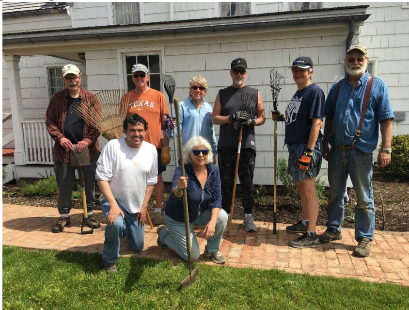
The 2022 Spring Cleanup Crew in action at our campus!

Coming in the next edition: Sneak peek at our 2023 Exhibit , update on the Dix Windmill , the Raynor Fish House , and upcoming events!